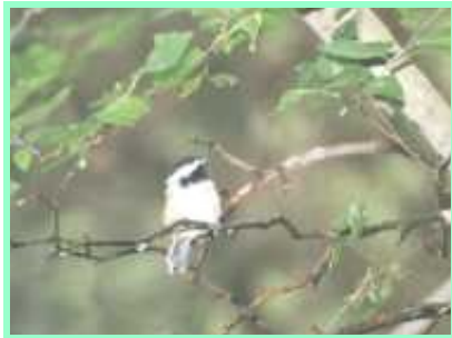
LEFT: A Chickadee enjoys a bath from a Misting System

Many desirable wild birds do not routinely visit bird feeders. ALL birds require water. We can enhance our opportunity to view a greater variety of birds by providing appropriate water sources for them and , at the same time, we are providing them with a very important biological requirement. Dependable water sources are important all year long. Birds require clean feathers in order to keep warm in the winter time.