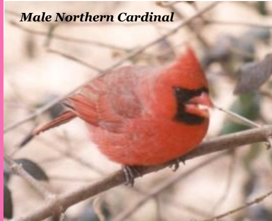
Male Northern Cardinal