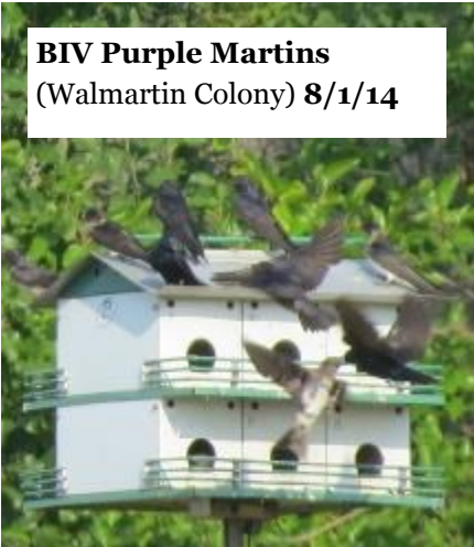
BIV Purple Martins (Walmart Colony) 8/1/14