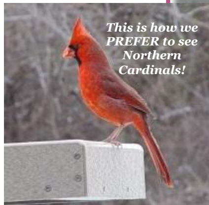
This is how we PREFER to see Northern Cardinals!

if it appears edible!). DON’T MISS THIS wonderful interaction going on in your yard NOW, because you are chasing down the definitive answer to “Cardinal baldness”! Maybe before you click on that one more link or type in another google search, check out the action in YOUR backyard. Need help creating a “Cardinal –friendly” habitat? Check out our Cardinals brochure on our website, as well as our brochure on young birds titled “ Birds: Their