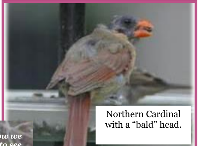
Northern Cardinal with a “bald” head.

Note from BIV about Scientific Research: We are SUPER grateful to all those dedicated researchers out there who help us enjoy our backyard birds more because of their wonderful and EXSTENSIVE efforts! Seriously, so much of what makes our backyard birding enjoyable came from sincere folks doing good, thorough investigation. Knowledge and Education are good things! It’s quite obviously important to us here at Birds-I-View...It has been a part of our mission since our inception. ( and we