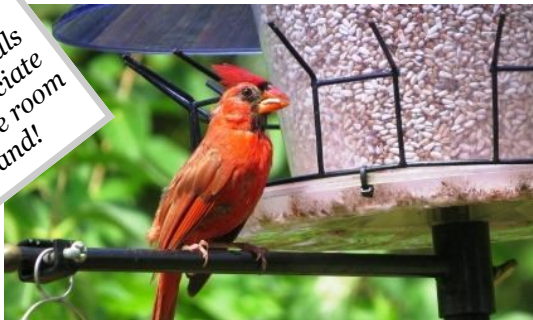
In the BIV Bird Garden

Extra Perch area at the Feeder is ALWAYS a great way to attract more birds...Cardinals really appreciate a little more room to stand!