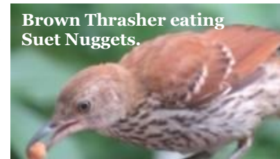
Brown Thrasher eating Suet Nuggets.

adult and immature Brown Thrashers coming to mealworms and Hot Pepper Suet Nuggets ( see pic this page) for weeks. Red-headed Woodpecker reports are always a joy to receive...we’ve had a few this month, including a sighting in the BIV Bird Garden on 8/14/14. A Bluebird pair on the NEW section of our BIV trail in JC has eggs ready to hatch any day. So many of you have reported much more successful third nestings of Bluebirds compared to previous (hot) summers!