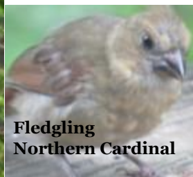
Fledgling Northern Cardinal