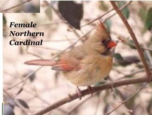
Female Northern Cardinal