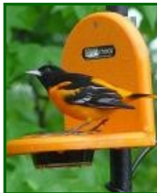
Above Left: Adult male Baltimore Oriole