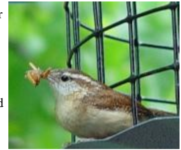
Above: a Carolina Wren gathers a mouthful of mealworms to carry to feed babies!