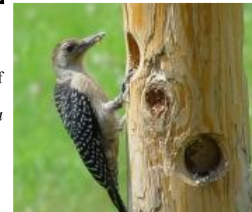
Immature Red-bellied Woodpecker on its own at the suet feeder!

Offering food stuffs suitable for immature birds allows the chance to watch a host of different activities by the birds: Courtship, feeding a mate on the nest, feeding nestlings, carrying food off to hidden fledglings, and FINALLY bringing the babies to the feeders to teach them where and how to get the food !