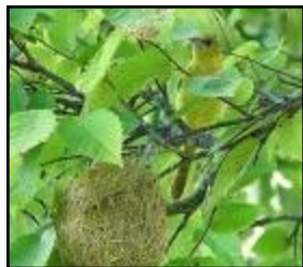
Orchard Oriole Nest

About Baby Birds on the Ground: Baby Birds on the ground are usually supposed to be on the ground. Many “open –nesting” birds have their babies leave the nest MUCH sooner than we humans often think they should. But the birds know what they are doing—the nest is where the babies are most vulnerable. Even though the babies often cannot fly when they leave these nests, they are safer being shuffled around on the ground and in low shrubs by the adults than in their nest. Consider interfering only if the birds are in direct danger from a cat, car, or some other unnatural threat. (and even then, please try not to take the bird away from the general area where it was found).