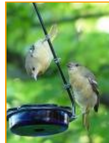
Above Right: Two juvenile Baltimore Orioles try out the jelly feeder! Live mealworms are also a favorite food for Orioles and a good alternative to jelly if bees are an issue.