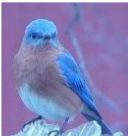
Adult male Eastern Bluebird