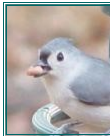
RIGHT: Juvenile Tufted Titmouse preparing to leave the nest box. LEFT: Adult Tufted Titmouse; Note the dark patch between the eyes & the completely dark bill lacking on the Juvenile bird.