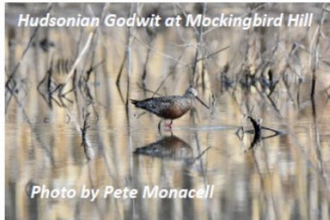
Hudsonian Godwit at Mockingbird Hill